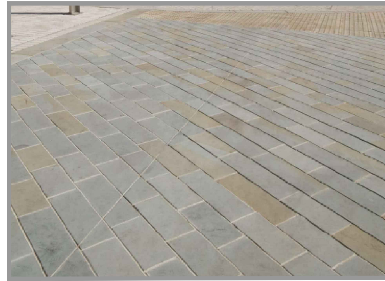
York Sett Paving