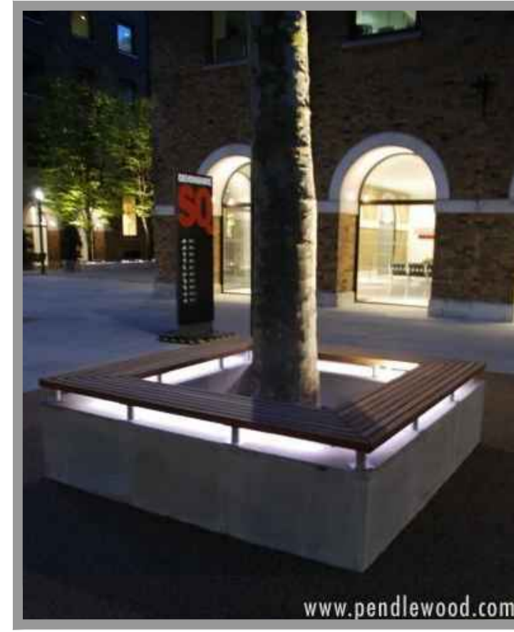
Tree Seat with Lighting