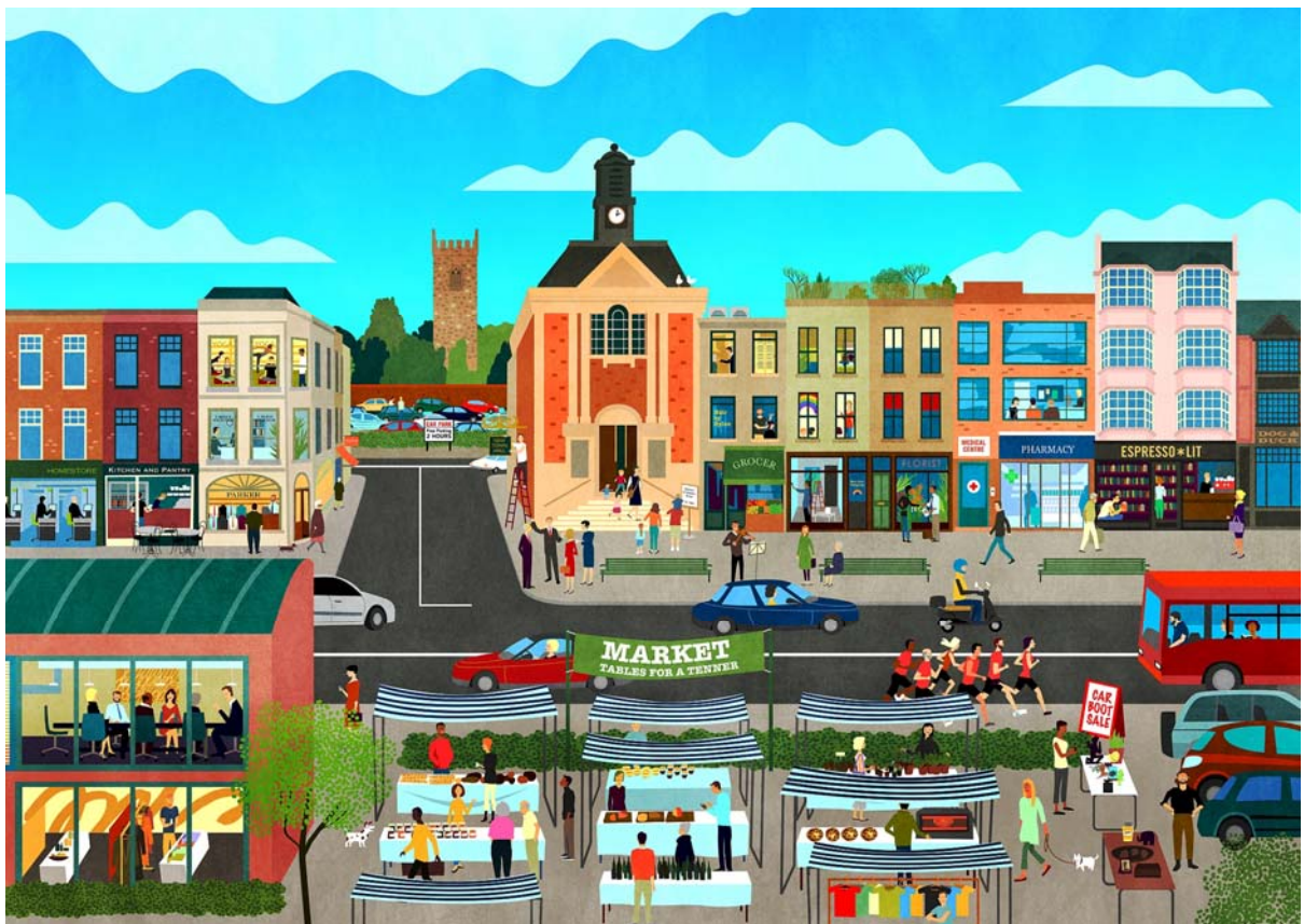
Illustration by Dermott Flynn