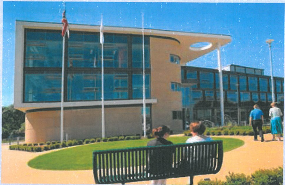
Parkside, Melton Mowbray, occupied by DWP and 15 other organisations

A good example of what can be achieved through co-location is Parkside in Melton Mowbray (above), where DWP has joined 15 other partner organisations in aligning 2015/16 public service delivery in the town.