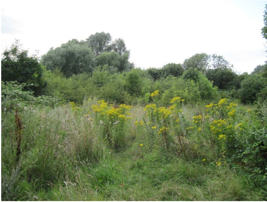
Entrances to the site