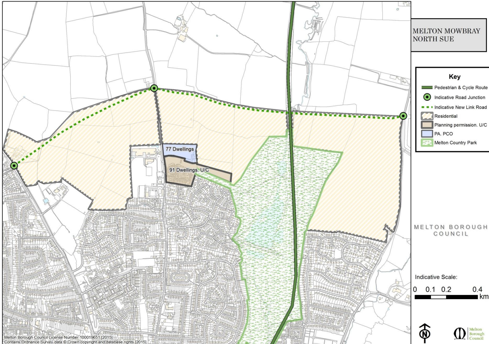
Figure 7: Melton Mowbray North Sustainable Neighbourhood Concept Map